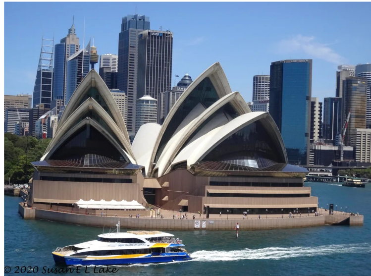
Sydney with its iconic Opera House would be at the top of my Port of Call images.

I "print" in a number of ways. Obviously, one of them is to incorporate some in my blog. I have actually been surprised when I try to find examples to illustrate a point to discover how many I have that touch me. It makes me wonder how else I might use some of my images.