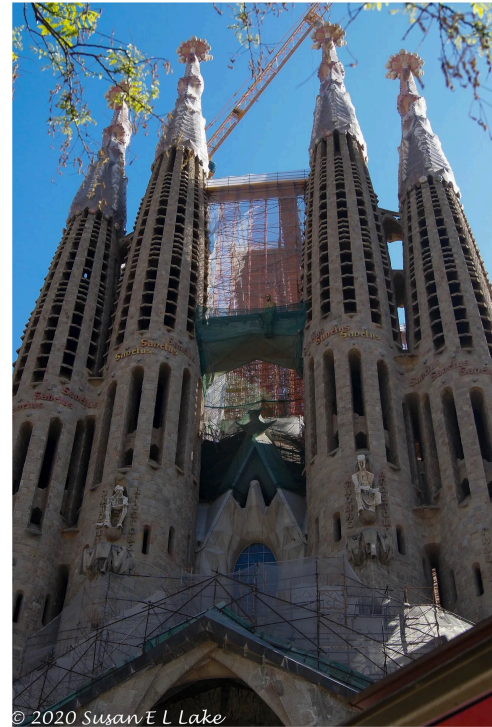
This image from the Sagrada Família would be found if I searched for Gaudi in my keywords.