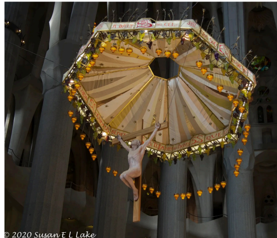
Because I took all these photos during different trips, it took me way too long to find this final Gaudi image. If I'd used keywords, it would have been so easy.