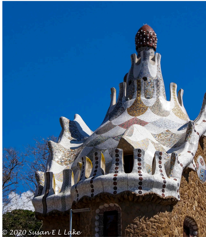
This image from the Park Güell would be found if I searched for Gaudi in my keywords.

One of those places I've discovered is a truly good series of courses (actually countless ones) offered by Creative Live ( www.creativelive.com ). They have instructional classes on a variety of creative topics: photography, web design, art, crafts, music, and many more. While these are paid classes, they do offer one free lesson a day as well as a daily On Air Now one. That means you can truly try before you buy. I've tried many of them that way and found some I couldn't "live without" and some that were just okay. One has become so essential to me that I